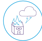
Fire / Lightning