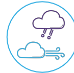
Wind / Hail